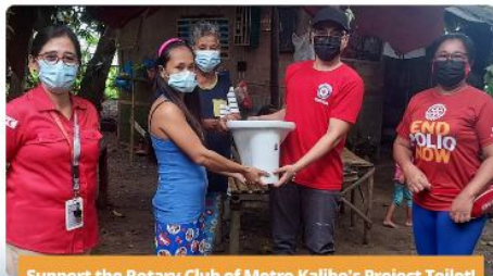
Support the Rotary Club of Metro Kalibo's Project Toilet!

@rid3850peopleofaction Rotary International District 3850 www.rotary3850.org