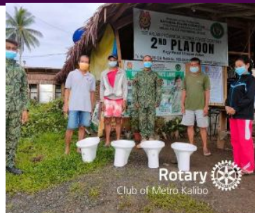
13 TOILET BOWLS DELIVERED FOR NOVEMBER

@rid3850peopleofaction Rotary International District 3850 www.rotary3850.org